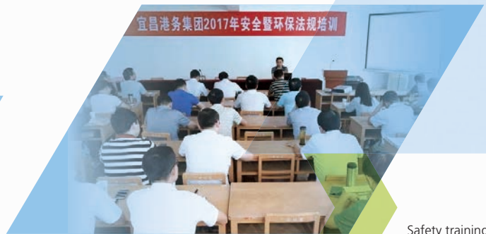
Safety training in Yichang Port 宜昌港的安全培訓