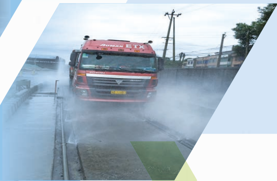
Wheel washing bay for vehicle entering or leaving port area of Yichang Port 車輛進入或離開宜昌港港區時的車輪清洗間