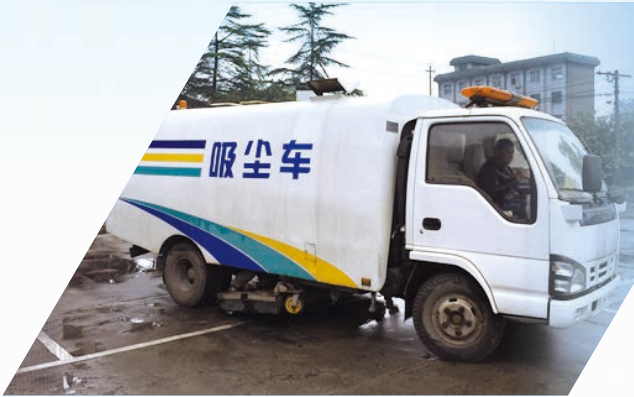
Dust suppression using vacuum cleaner truck at port area of Yichang Port 於宜昌港港區使用吸塵車抑制粉塵