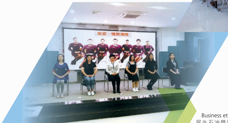
Business etiquette training held by Minsheng Gas 民生石油舉辦的禮儀培訓活動