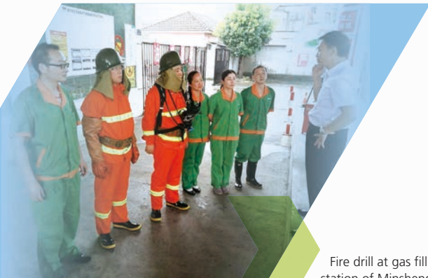
Fire drill at gas filling station of Minsheng Gas 民生石油加氣站的消防演習

於截至2017年3月31日止年度，沒有發生對保華產生重大不利影響的重大職業健康及安全違法事項。