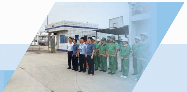
Fire drills at LPG storage-tank farm of Minsheng Gas 民生石油儲配庫的消防演習