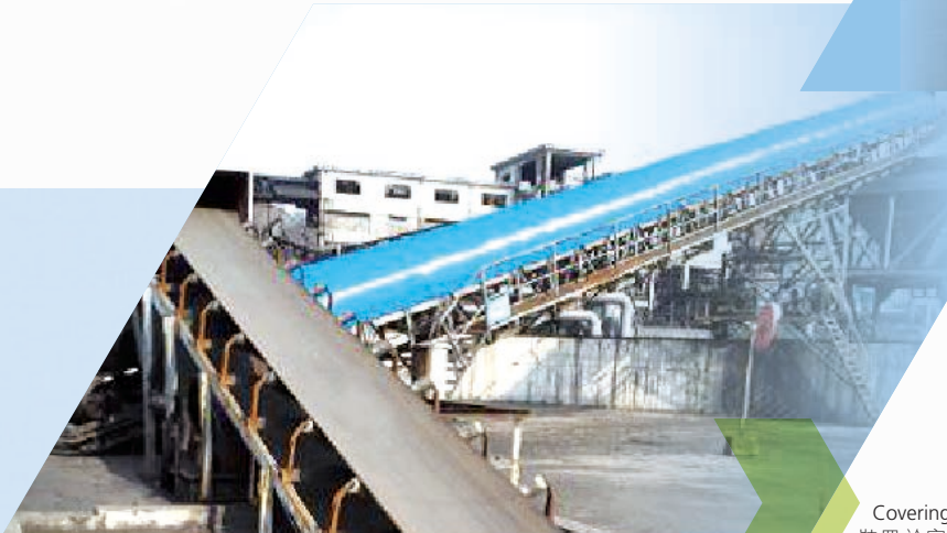
Covering for the conveyor belt at port area of Yichang Port 裝置於宜昌港港區的傳送帶上之覆蓋