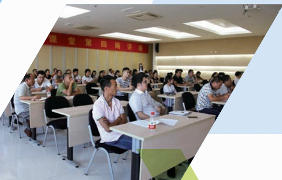
Periodical training held by Jiaxing Feeder Port 嘉興內河碼頭定期舉辦的培訓活動