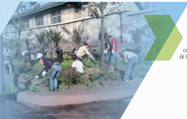
Community clean-up activities organized by Yichang Port 宜昌港組織的社區清潔活動

在回饋社區方面，我們竭力履行承諾，尤其著重教育和青少年發展方面，體現於贊助南通的學生進行學術交流活動達十一年。年內，保華連同保華建業，捐贈了100萬港元給「希望之友教育基金」，以支持香港和內地的教育發展。連續九年，我們獲得了香港社會服務聯會頒發的「商界展關懷」的稱號，以表彰我們的企業公民責任和我們對社區關愛的持續努力。我們內地的經營單位也同樣開展當地的各項活動來履行我們回報社會的承諾並加強與周邊社區的聯繫。例如，我們在宜昌（中國湖北省）的業務單位，積極參與當地政府發起的扶貧項目。