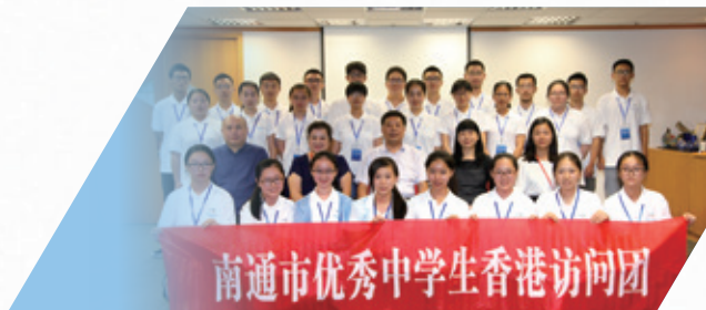
Educational exchange program for students coming from Nantong sponsored by PYI 保華贊助來自南通的學生來港學習交流